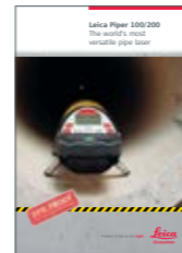
Leica Piper 100/200 Brochure