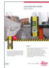
Leica Rod Eye Series Data sheet