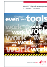
PROTECT by Leica Geosystems Brochure