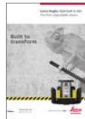
Leica Rugby CLA/CLH/CLI Brochure

Illustrations, descriptions and technical data are not binding. All rights reserved. Printed in Switzerland - Copyright Leica Geosystems AG, Heerbrugg, Switzerland, 2018. 812719en - 08.18